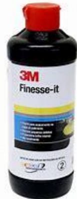
3M Finess IT available at most auto parts stores or paint and body supply stores. About $20 for a 16 oz. bottle