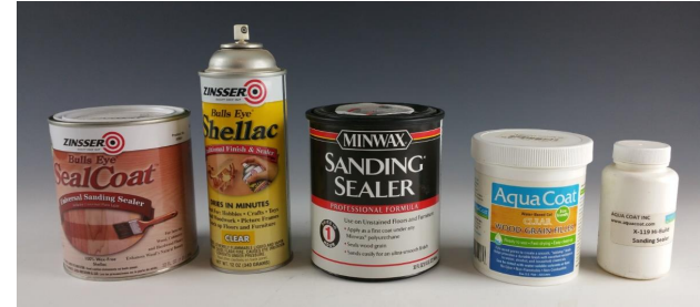
Zinsser universal shellac sanding sealer Zinsser de-waxed shellac MINWAX universal water based sanding sealer AquaCoat water based clear grain filler AquaCoat X19 high build water based sanding sealer.