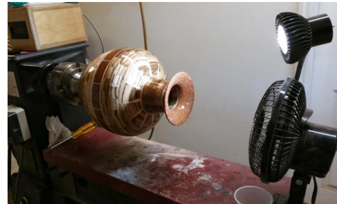
A small fan speeds up the flashing over point for the inside of bowls and vases