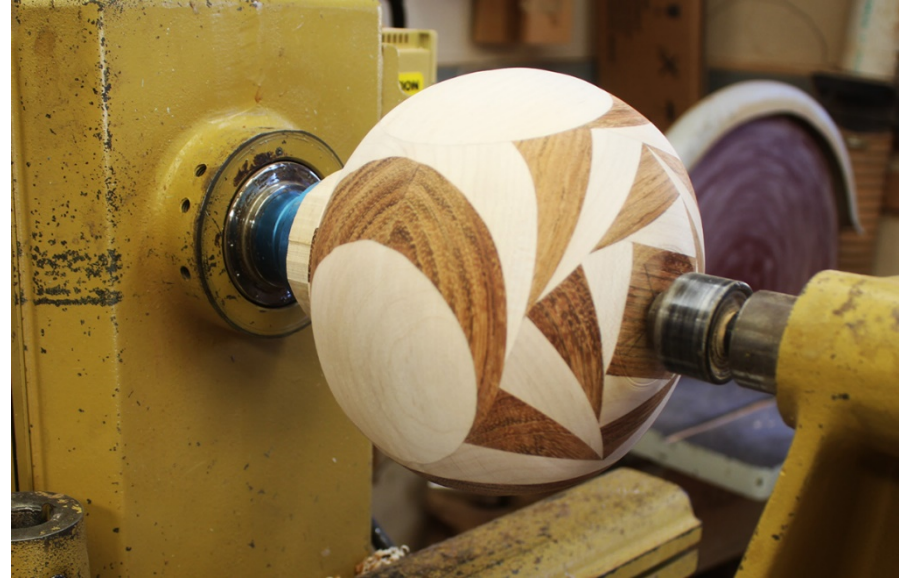
Form outside shape